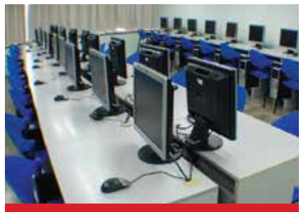
ONLINE COMPUTER ROOMS

As technology continues to expand, the College offers well-equipped networked computer laboratories on the IT floor for all its IT related subjects.