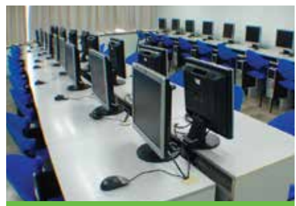
ONLINE COMPUTER ROOMS

As technology continues to expand, the College offers well-equipped networked computer laboratories on the IT floor for all its IT related subjects.