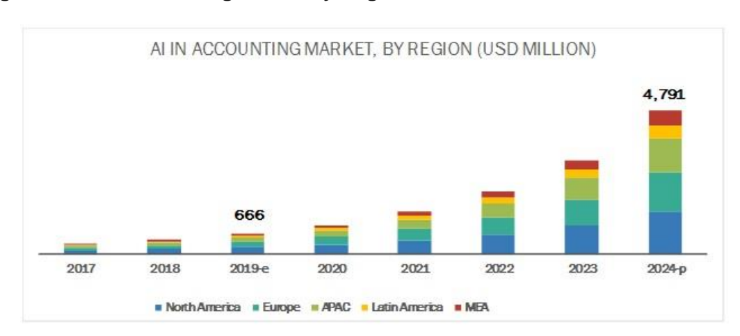
Figure 1. Al in Accounting Market by Region

Where it can increase productivity and reducing the impact of the possible risk on the company's reputation. Integration with AI in a company operation can enhance strategic planning and replaces human massages such as Robotics and Natural language processing (NLP) (Ta, 2020). The system refers to historical information to adapt to an event. Since the Covid-19 pandemic, the expertise is insisting on partnering with the technology companies because it can help the company's interaction with their clients from afar places. Such as NLP and computer vision are often providing the actual-time basis of financial matters by dealing out documents quicker, and daily reporting. Moreover, the management is selected as a "wait-and-see" behavior (Clarke & Liesch, 2017). This helps the management implement technologies in the financial operation when there is uncertainty. The AI relies on access to massive volumes of data to be effective. It requires extraction and correct and secure data transformation. As the study of Yoon (2020), Korean companies had a faster transformation in their accounting process by using technology during the New Normal.