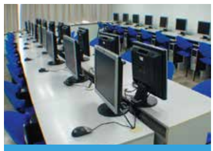
ONLINE COMPUTER ROOMS

As technology continues to expand, the College offers well-equipped networked computer laboratories on the IT floor for all its IT related subjects.